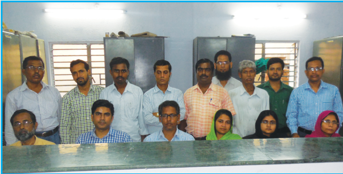
COLLEGE AND NSOU STAFF